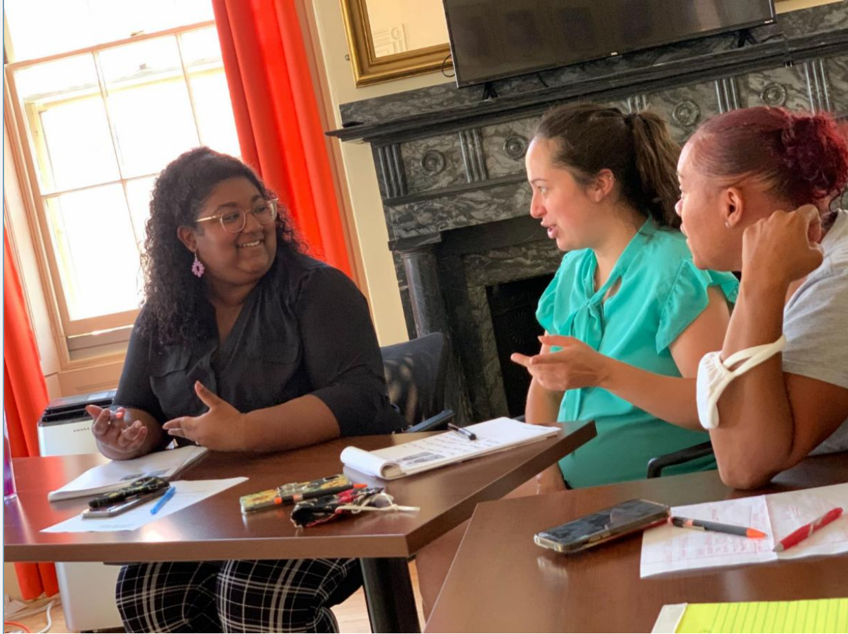
YWCA of Southeastern Massachusetts DEI Training