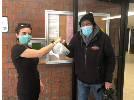
Making an impact - Marion Institute's Cooks for Community Emergency Food Initiative

Did you know this year you can take up to a $300 deduction for cash donations? Read on about this change to the tax code and how giving to a community foundation can be a wise decision when wanting to make an impact locally.