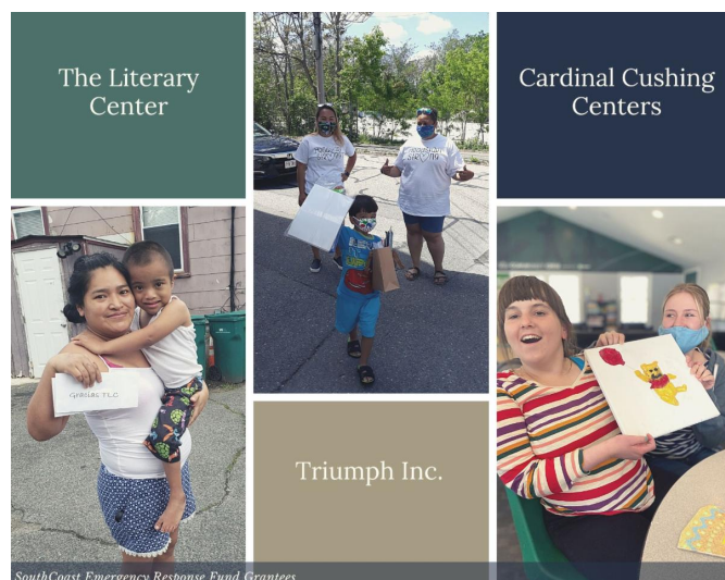
SouthCoast Emergency Response Fund Grantees

The Hockomock Area YMCA in North Attleboro received $100,000 to provide family-sized grocery bags to those in need in the communities they serve. During the first week of COVID-19 closures, they gave out 74 bags. That has grown to more than 1,000 bags per week.