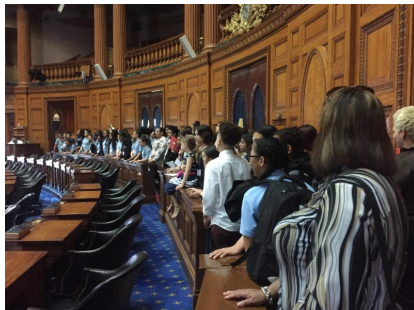
OSS at State House Chamber